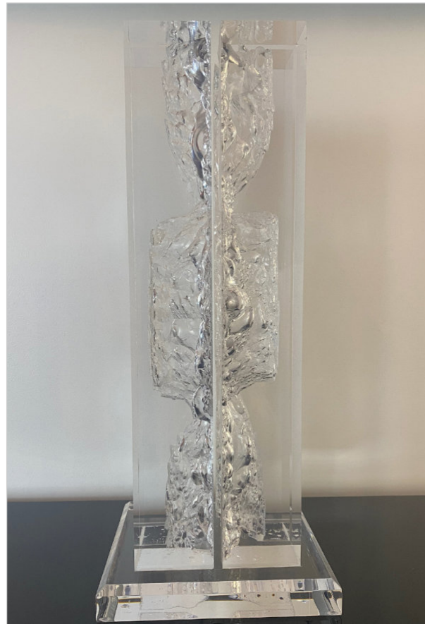
Ice Candy Block

They are carved from solid plexiglass using a hammer and chisel and polished to a glass-like finish.